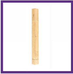
IG BUILDERS CHALLENGE