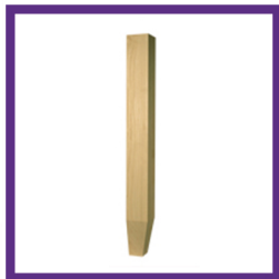
HOUSE OF WOOD TAPERED