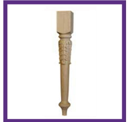
ACANTHUS LEAF CARVED