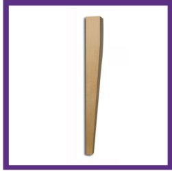
TAPERED - 2 SIDED