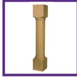
SHANTY TO CHIC