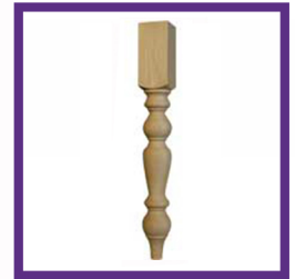
OLD ENGLISH COUNTRY