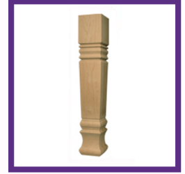
HUSKY SQUARE FARM